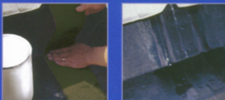
Typical Unifold Joint Detail